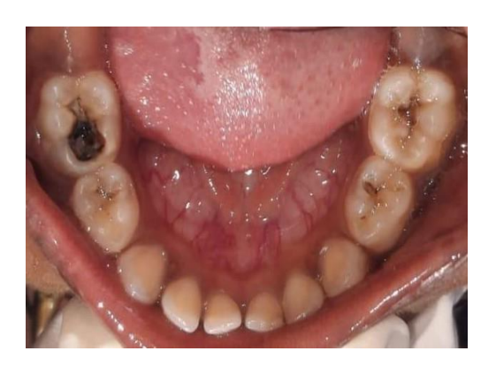
LOWER OCCLUSAL VIEW