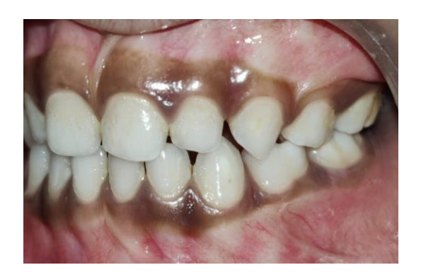
LEFT LATERAL VIEW